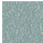
Métal bleu ciel