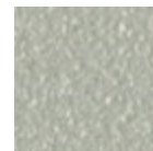
Métal gris claire