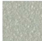
Métal gris claire