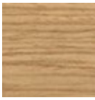
Plaqué de frêne laqué