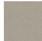
Métal gris cendre