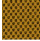
Network fabric 9 Colors