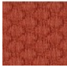
Visual fabric 13 Colors