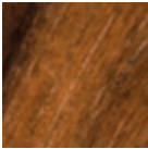
Veneered flamed walnut