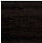
Black lacquered veneered ash