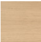
Natural oak veneered